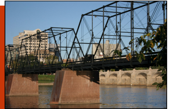
Walnut Street Bridge